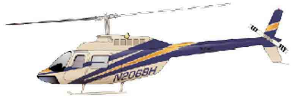
OPTIONAL CORPORATE 8-PLACE SEATING

The Airstream Bambi's light weight allows you to tow it easily and safely with your Sports Utility Vehicle, mini-van, or many popular cars; and its small size means you can hitch up and go on a moment's notice, quickly and without a lot of fuss. Yet you'll still take along all the amenities: bed, bathroom, fully-equipped kitchen, heat and air conditioning. Timeless design, superb aerodynamics, and legendary engineering.