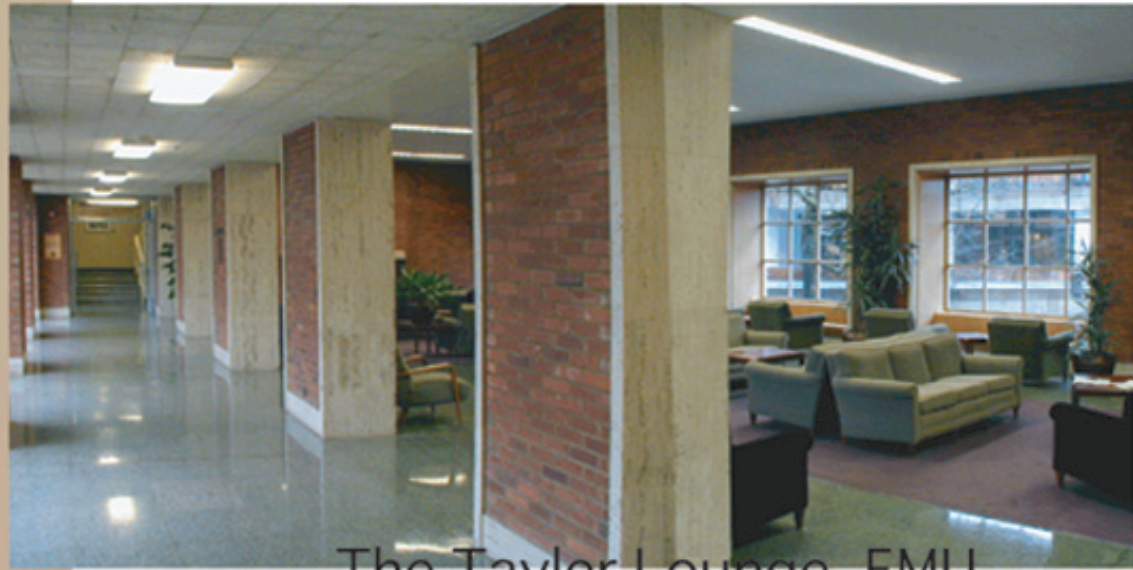
The Tayler Lounge, EMU

The Ultimate comfortable space in public, along the major circulation