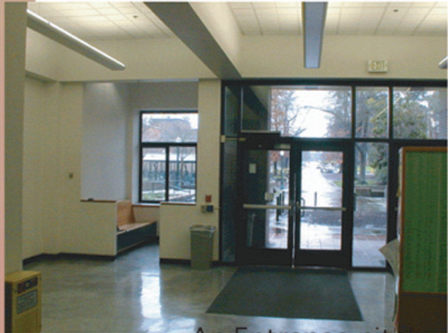
An Entrance nitch

On the contrary, the niches by the main entrance hall at the Lawrence Hall, in where our school of architecture is located, seems to fail to attract any person to have a seat there even in a short period of time. Through this precedent study prevailed the secrets to make a space special.