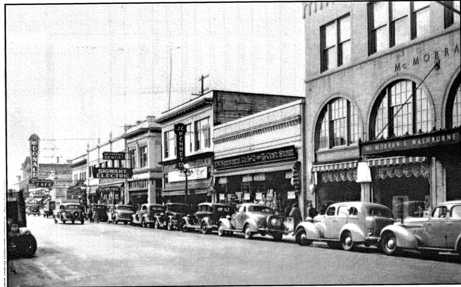
Willamette Street, from 9th Avenue, August 25, 1936 McMorrان & Washburne Store at far right