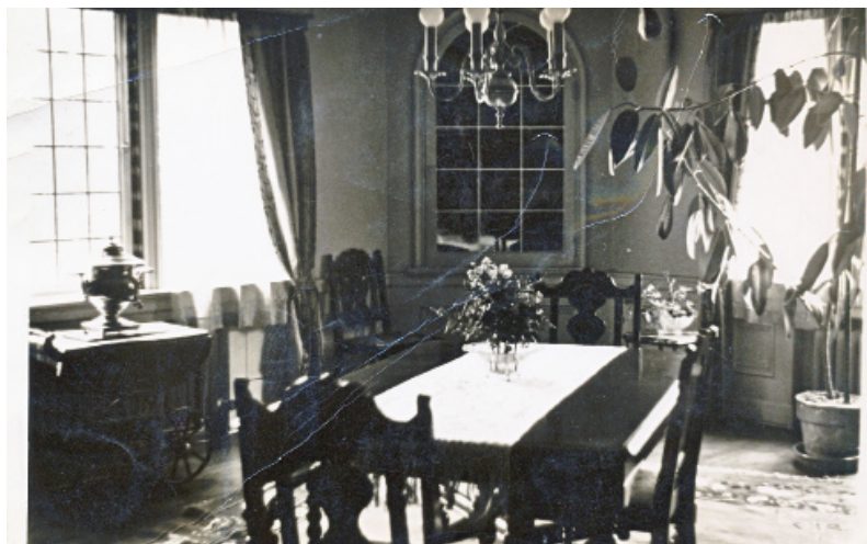
Formal dining room - 1932

The McMorrans house has been well cared for by the University of Oregon since 1941. All repairs and remodels to the house and gardens have been carefully monitored to preserve the original character and style of the house. Continued care of the McMorrans House will ensure that this historically significant resource will be preserved and available for use by successive University of Oregon presidents and the campus community for many years to come.