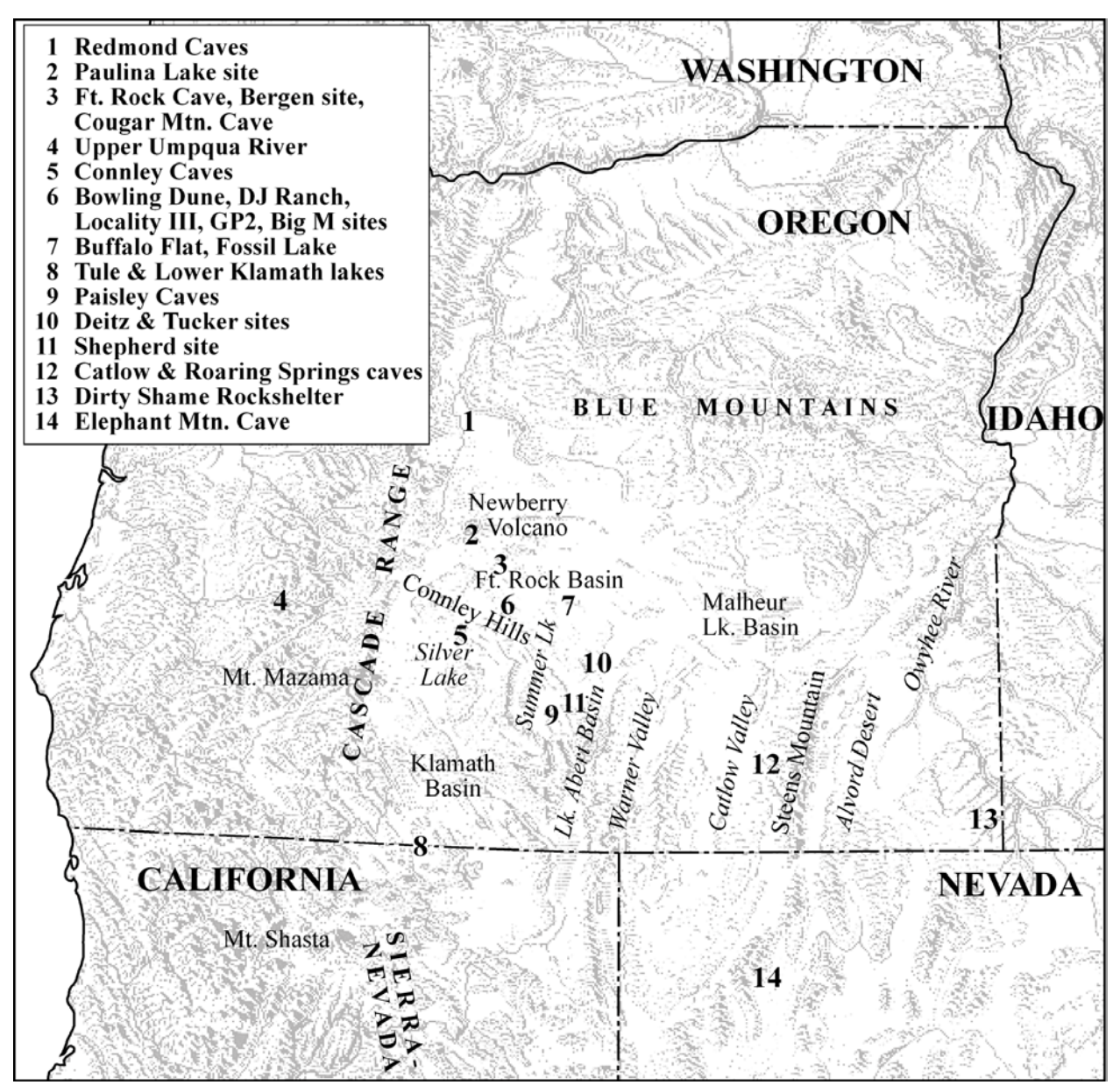
Figure 1. Physiographic features and archaeological sites in the Northern Great Basin.

appear to cluster significantly along a time-line, while in reality the clustering is due to causes such as fluctuating solar activity, variance in the amount of atmospheric insolation from cosmic ray activity, or the so called "atom bomb" effect which caused an artificial enrichment of the earth's atmosphere with radioactive isotopes of carbon after 1945. There are other possible anomalies as well.